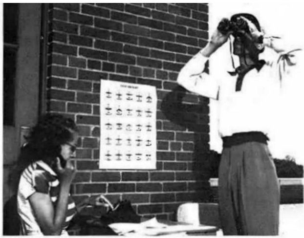
One of the more than 16,500 Ground Observer Corps (GOC) observation posts manned by some 400,000 active civilian GOC volunteers during the '50s. The observer corps network known as "Operation Skywatch" was disbanded in 1959 when SAGE eliminated the need for visual surveillance

By the late 1950's, great strides had been made in the development of long-range high-altitude radar. According to the U.S. Defense Department, the skies above our country and Canada could be protected by the new technology. As a result, on January 26, 1958, all 17,000 Ground Observation Posts across the country were ordered by President Eisenhower to stand down. He sent the following message to the 380,000 observers that had participated in the program.